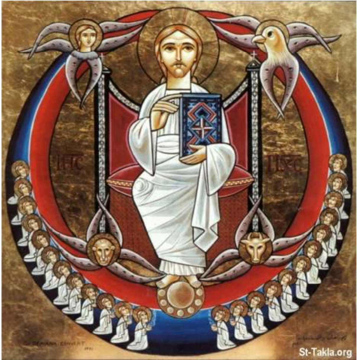
Modern Coptic icon of Jesus Christ , by the nuns of St. Demiana Monastery, El Barary, Egypt

أيقونة قبطية حديثة تصور السيد المسيح ، رسم راهبات دير الشهيد دميانة، البراري، مصر