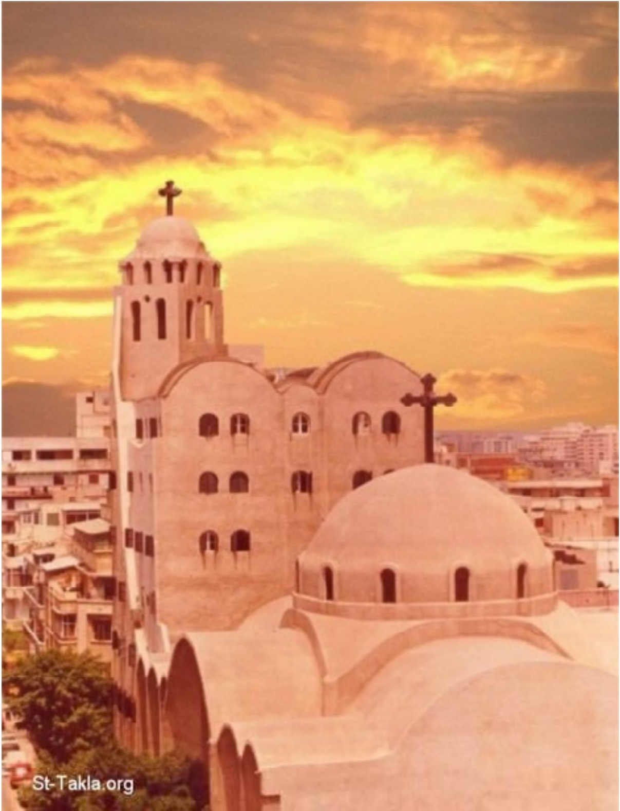
A COC : Coptic Orthodox Church: St. Takla Himanot Church, Alexandria, Egypt